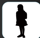
■ Searching Lost Children