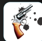
■ Criminal Investigation (AFIS)